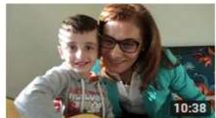
Sponsorship and Settlement of Privately Sponsored...

Thank you for another successful National SAH Conference!