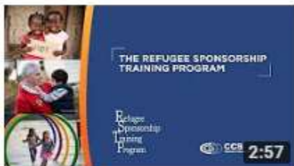
The Refugee Sponsorship Training Program

https://www.youtube.com/user/RefugeeSponsorship