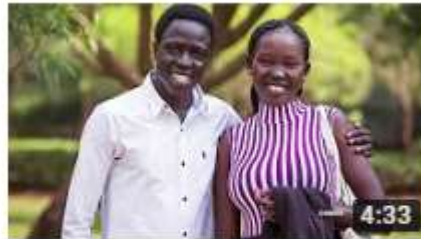
The Blended Visa Office-Referred Program