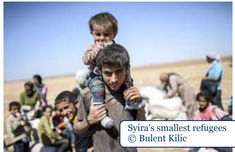
Syria's smallest refugees

Sponsorship needs: The family would feel more secure with the assistance of a sponsor. They will benefit physically, emotionally and socially from relationships with trusted people who can help them with their new life in their community.