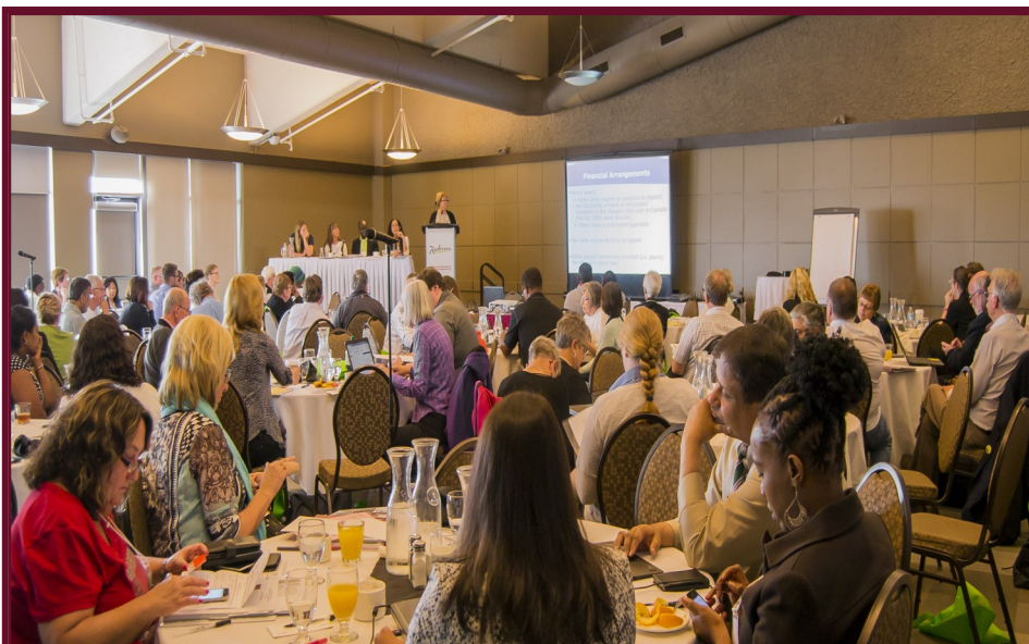
Picture from 2015 SAH Conference

Where: Wesley Urban Ministries Inc., 52 Catharine Street North. Hamilton, ON