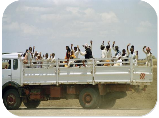
Long term Eritrean refugees returning from Sudan

The UNHCR works with governments internationally to offer a durable solution to refugees.