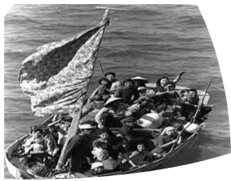
Boat People fleeing from Vietnam arrive in Canada

A refugee is someone who has a well founded fear of persecution based on their race, religion, nationality, membership of a particular social group, or political opinion, is outside the country of his/her nationality and due to that fear is unable or unwilling to return.