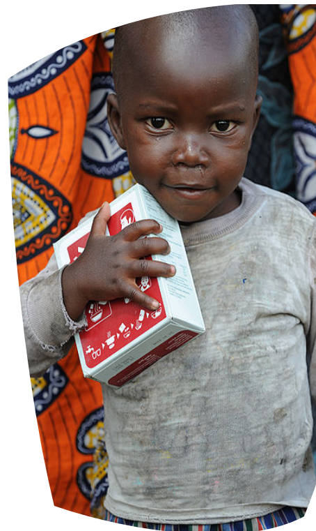
A boy receives food during a distribution to refugees in Congo

Additionally, Canada's private sponsorship program is unique as it allows private groups across Canada to sponsor qualifying refugees above the government numbers.