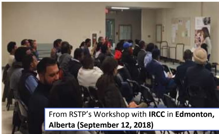
From RSTP's Workshop with IRCC in Edmonton, Alberta (September 12, 2018)

Please register by clicking: https://attendee.gotowebinar.com/register/1249530487215513857