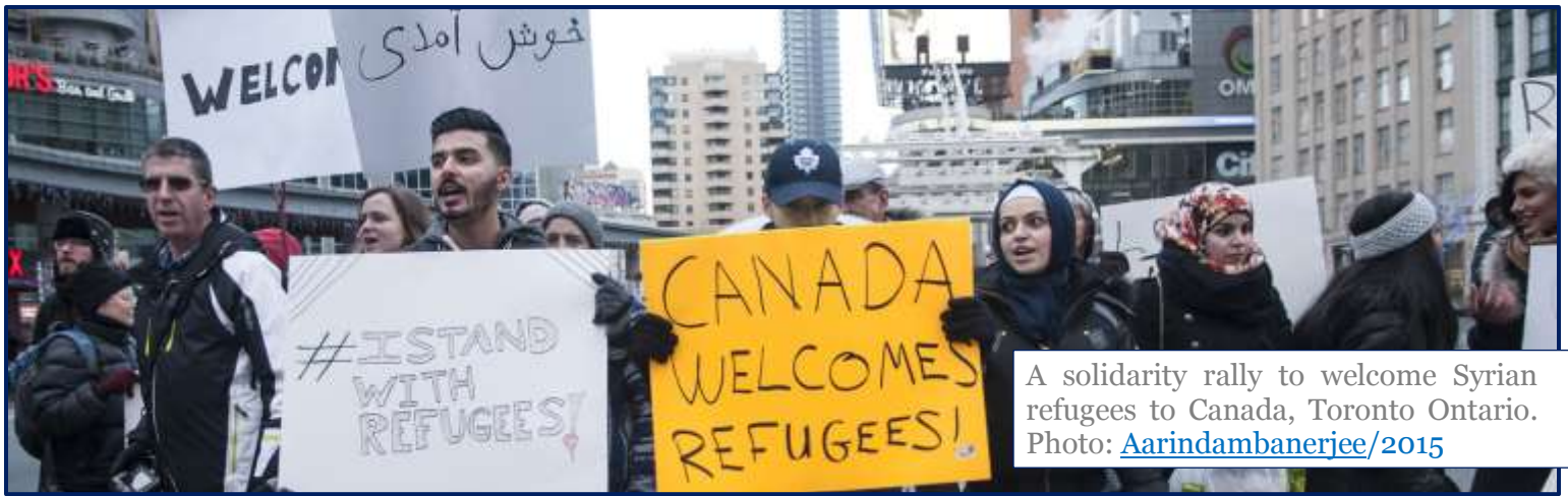
A solidarity rally to welcome Syrian refugees to Canada, Toronto Ontario.