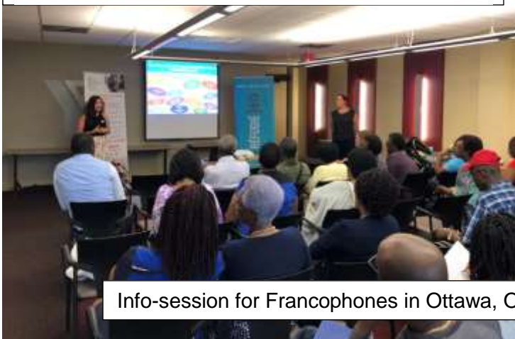
Info-session for Francophones in Ottawa, Ontario

https://www.eventbrite.ca/e/private-sponsorship-of-refugees-psr-information-session-tickets-48382119221